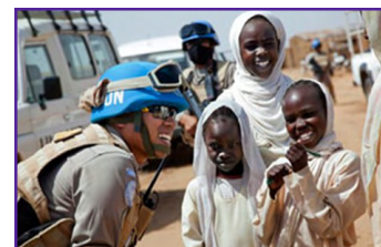
UN Peacekeeper on assignment