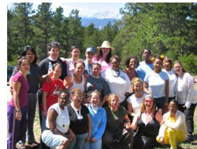
Project WISE participants

“More women are coming to Project WISE unemployed and with more severe mental health symptoms.”