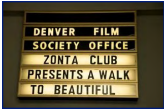
First Day of Film 2009

"We have 'The Tree of Life' display carved by famous artist Edgar Britton."