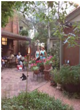
Liz's garden with Zontians and cat

“Governor’s Seminar to be held at DoubleTree DTC on September 21-23.”