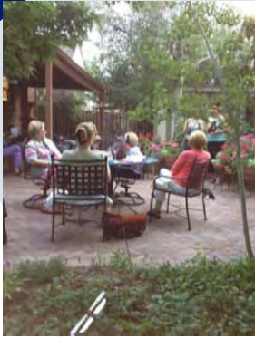
Members enjoy August meeting

“Governor’s Seminar to be held at DoubleTree DTC on September 21-23.”