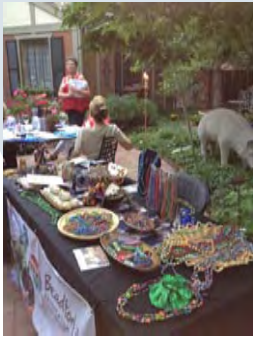
BeadforLife products on display

“Beads and shea butter provide an easy service project that supports BeadforLife members in Uganda.”