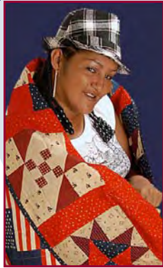
Delores Project resident

The Service Committee is in a holding pattern at the moment as we await the arrival of grant applications. We have received one application as of this week.