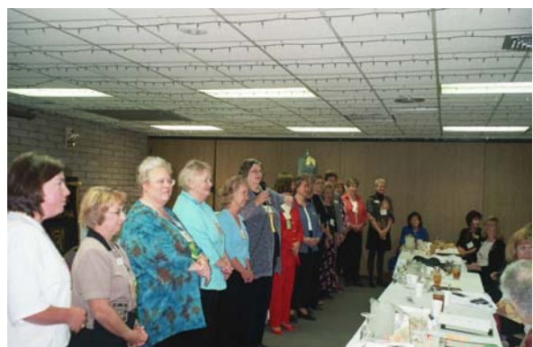
First Timers at District 12