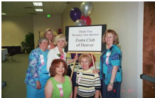
Zonta Resource Room with Zontian Volunteers 2004