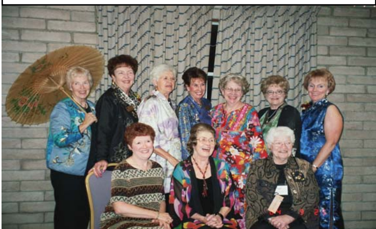
District 12 Past and Current Governors all dolled up for the evening!