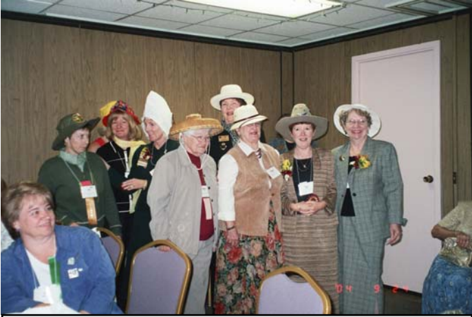
Skit about the history of the district "Parade of Countries"