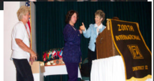
Converse County wins Service Award and the right to display flags for the upcoming year!