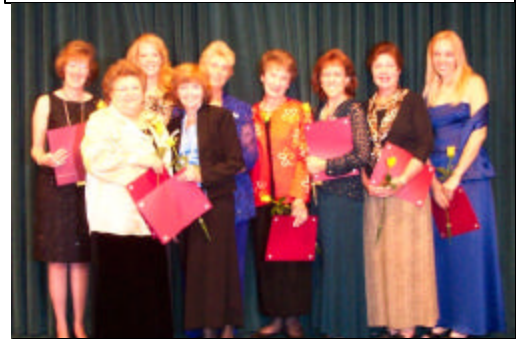
Zontians of the Year for District 12