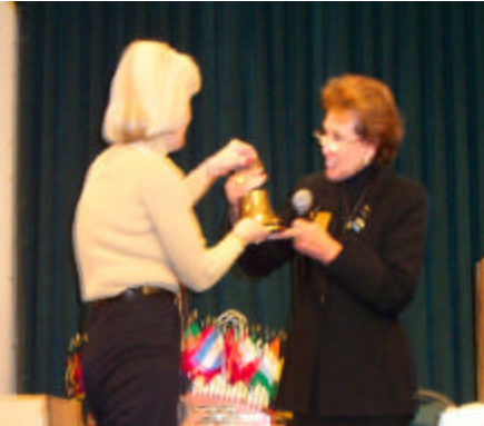
Zonta Club of Denver wins most members attending for clubs under 40 (we had 12 out of 39!)