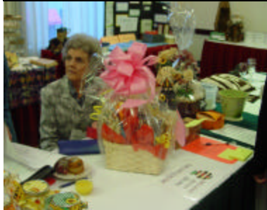
Zonta Store Sales