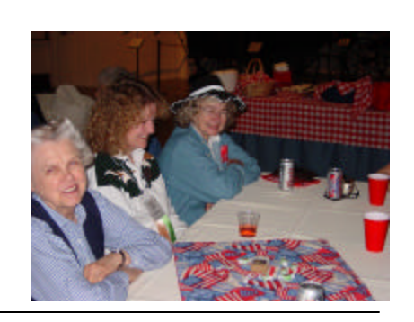
Friday evening fun!