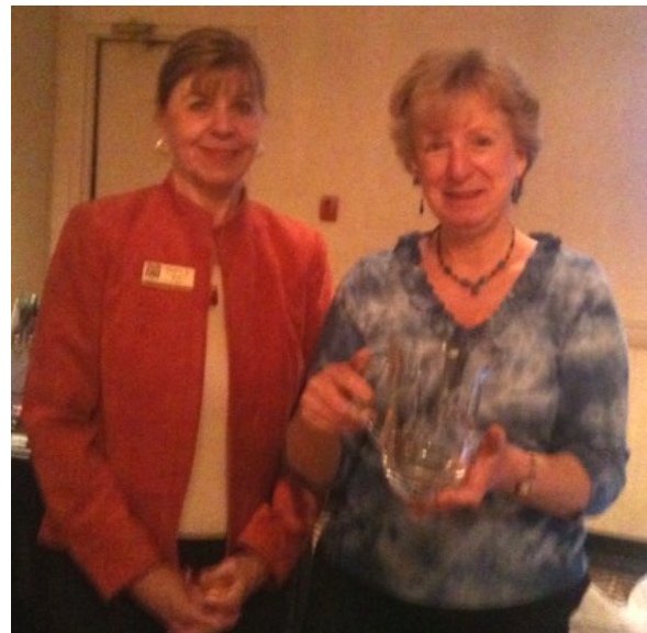
2009 and 2010 Zontians of the Year