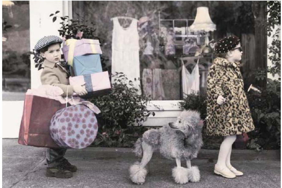
Shopping..... Shopping..... Shopping.....shopping.....

☞ We need you! Please come & volunteer, please come & shop, please come!