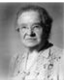
Dr. Florence Rena Sabin - noted scientist and pioneer in public health from Colorado