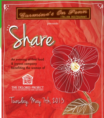
Share dinner at Carmine's on Penn