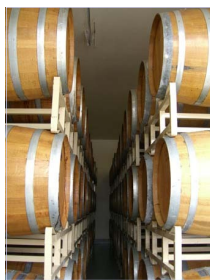
Wine Casks at Spero Winery