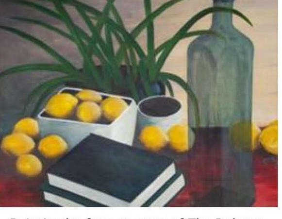
Painting by former guest of The Delores Project.

The Art Program is in need of art supplies for our 10-12 guests who regularly participate. If you've got some art supplies (e.g., artist quality drawing supplies, ink pens, drawing pencils, pastels, water colors, acrylic paint) that you'd like to donate please contact us at (303) 534-5411.