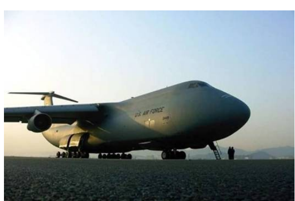
TIMES ARE CHANGING

While the C-5 was turning over its engines, a female crewman gave the G.I.s on board the usual information regarding seat belts, emergency exits, etc.