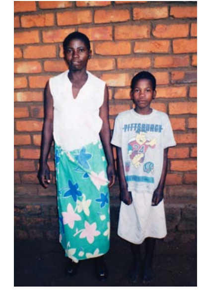
2003, with her mother