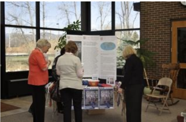
ZCD's Fund-Raising Table