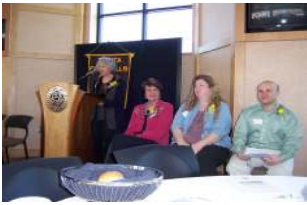
Foothiills Golden 1st Annual Author's Luncheon