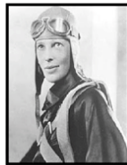
Amelia Earhart Zonta Clubs of Boston, Massachusetts New York, New York USA

In honor of Zonta International's 85th Anniversary, we will highlight 85 Zontians who have made vital contributions to Zonta, their communities and the world. Please read The Zontian magazine and visit this page frequently to learn about these memorable and influential women.