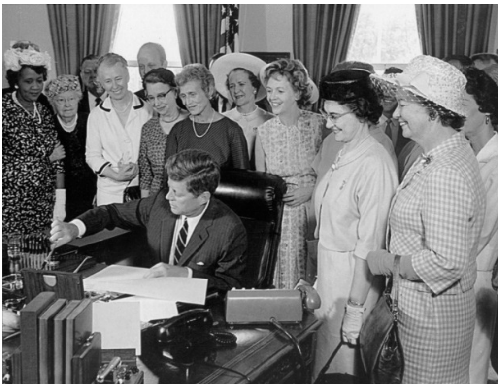
Women celebrate as President Kennedy signs the Equal Pay Act in 1963