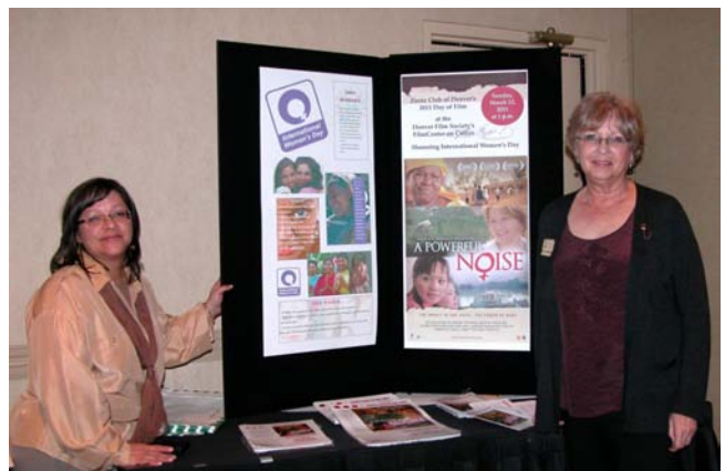
Day of Film display