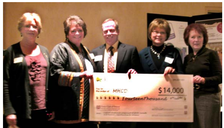
Mental Health Center of Denver