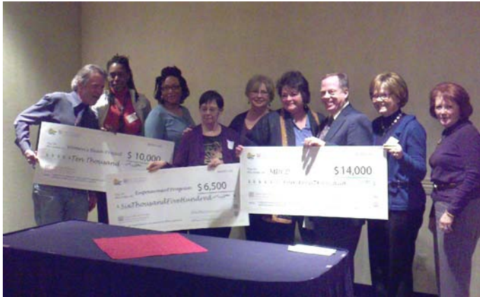
2011 grant recipients and their big checks