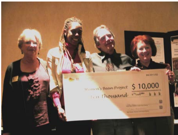
Women's Bean Project