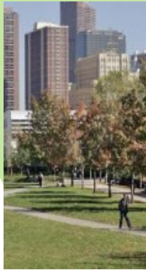
Downtown Denver from Metro's Auraria campus