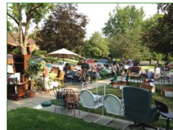
Garage sale —early in the day