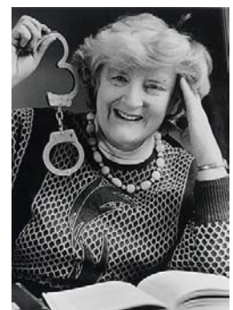
English crime novelist Catherine Aird