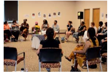
Inspiration Workshop