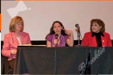
2010 Day of Film Panel Discussion

“Last biennium our District 12 went from the bottom third to the top 10 of districts for individual giving!”