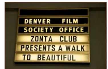
2009 Day of Film