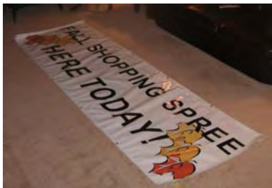
Banner seeking its forever home