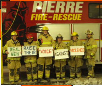
“Real Men Raise Their Voice against Violence”

against women and girls. In addition to the ribbons, club members handed out candy canes and chocolates to children and adults and shared hot cocoa and coffee to ward off the chilly day. “The coffee and cocoa were a really good idea. When people were told it was no charge, they asked if they could make a donation. We quickly rounded up a donation box, and the money collected will be given to Working Against Violence, Inc., a local