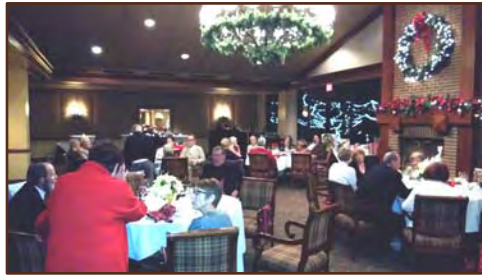
December holiday party