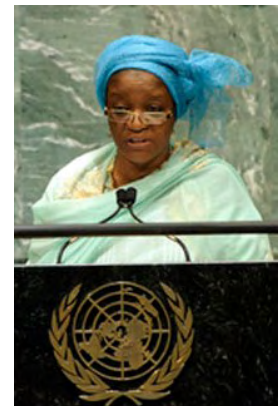
Zainab Bangura addresses U.N. General Assembly

This article is a summary of the Women Enews report. Go here to read the full story.