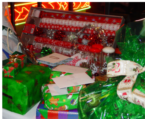
Gifts for the Adopt-a-family spread tons of cheer! Thank you Zontians for your support!