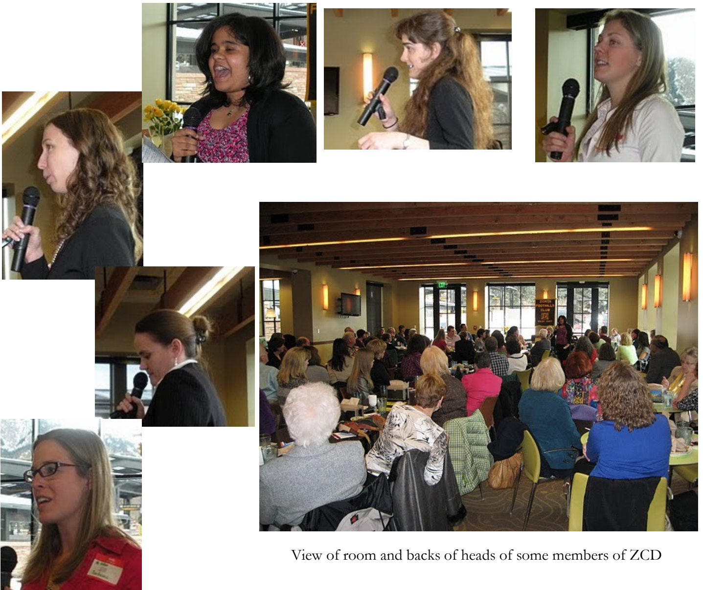
View of room and backs of heads of some members of ZCD