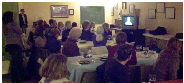
Joy House shows video about their work