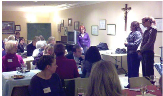
Report by Delores Project on ZCD 2010 grant