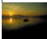
Midnight Sun Lapland