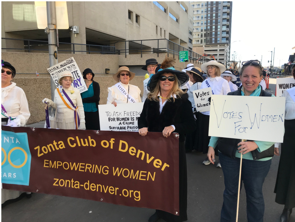
Zontians assembling for the Veterans Day Parade Celebrating Zonta's 100th birthday and Votes for Women Centennial