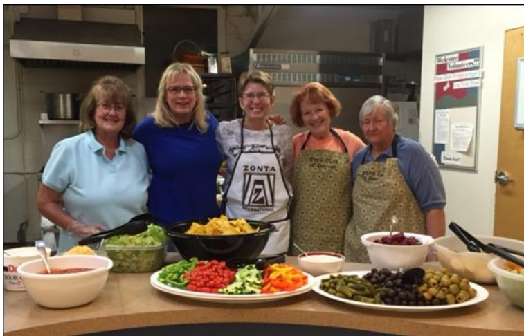
Yummy Mexican food at Delores Project in November - Great food, good company!