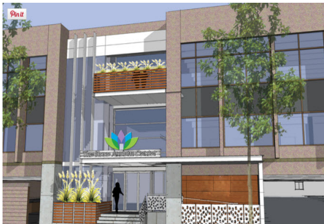
Architectural Rendering of front of building at 1330 Fox