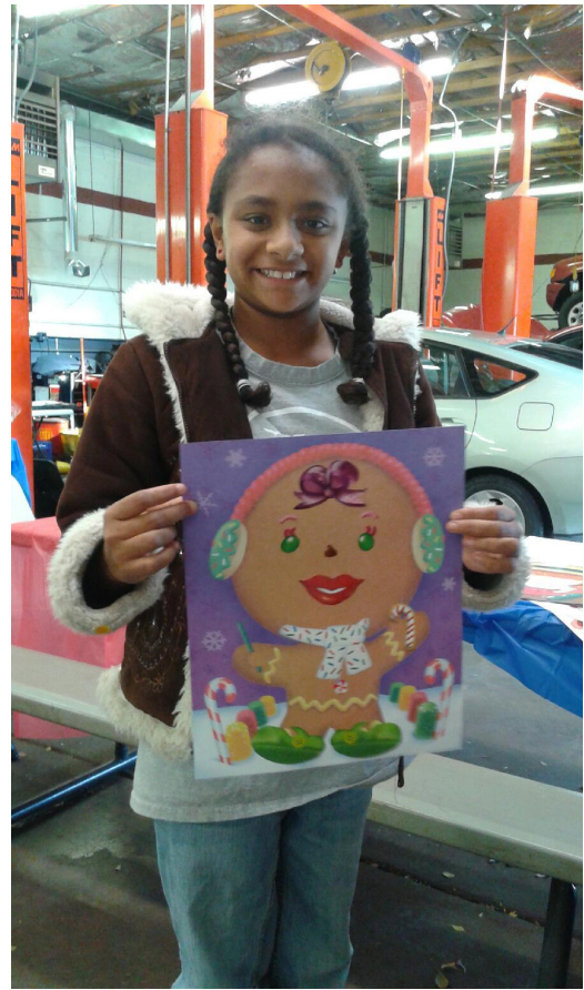
Fun at hands of the Carpenter on Nov 21st!