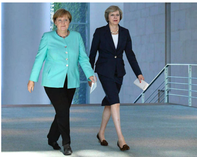
German Chancellor Angela Merkel and U.K. Prime Minister Theresa May