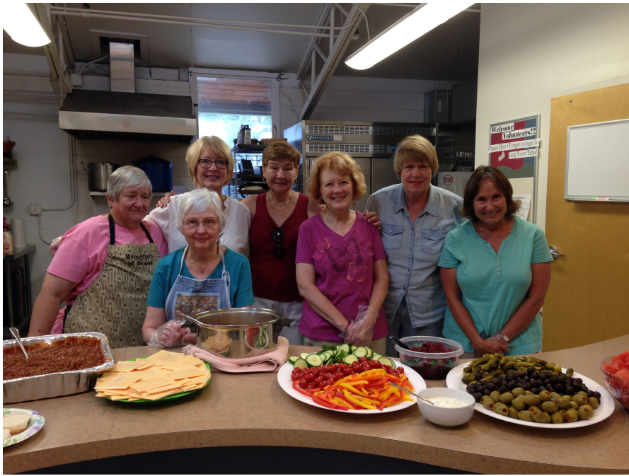
Serving dinner at Delores July 2015

Please thank and patronize our 2015 Day of Film Sponsors!