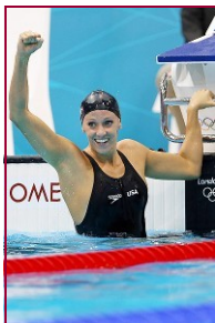
American Dana Vollmer Wins 100-meter Butterfly Gold Medal at 2012 Olympics

“We dare not sit back and expect someone else to do the work for us.”