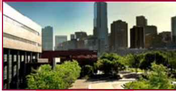
Metropolitan State University of Denver

Guest speaker expressed gratitude for club scholarship.