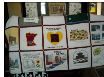
Zonta Quilt at Amelia Earhart Museum