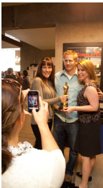
Day of Film 2012 photo-op