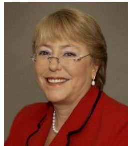
Michelle Bachelet Executive Director UN Women ZI Convention keynote speaker

combines traditional and contemporary media, is proven to be both cost-effective and efficient in