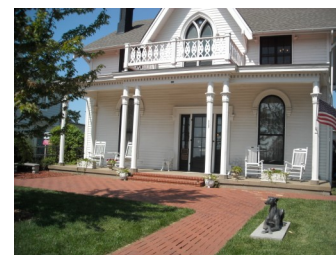
Amelia Earhart Museum

When you get your berries home, mix one part vinegar (white or apple cider) and ten parts water. Dump the berries into the mixture and swirl around. Drain, rinse if you want (though the mixture is so diluted you can't taste the vinegar,) and pop in the fridge. The vinegar kills any mold spores and bacteria that might be on the surface of the fruit, and voila! Raspberries will last a week or more, and strawberries almost two weeks.