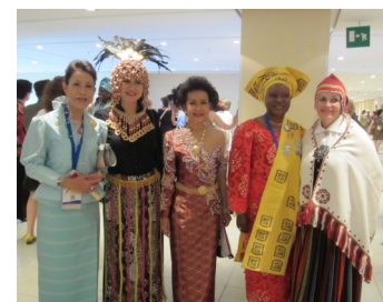
Zontians in the traditional costumes of their countries

"There is a lot to be excited about and to brag about in the Zonta World"