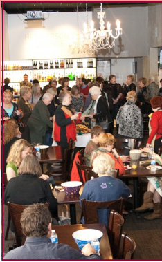
Day of Film 2012 reception