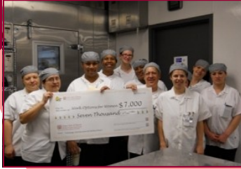
WOW students hold ZCD big check

“WOW beat out its 2011 number of employment placements halfway through this fiscal year.”