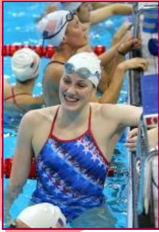
Denver's Missy Franklin Wins Bronze Medal in 4 x 100-meter Relay at 2012 Olympics

“We dare not sit back and expect someone else to do the work for us.”