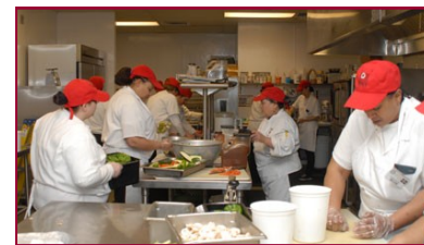
WOW students in the kitchen