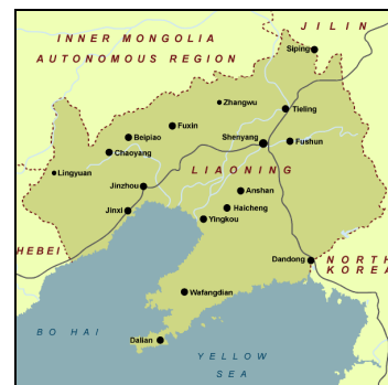
Map of Liaoning, China Jiwei Gu's birthplace

"In China, boys are thought to be superior. Girls live in poverty with little respect."