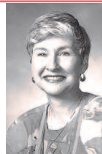
Board of Directors Meetings: