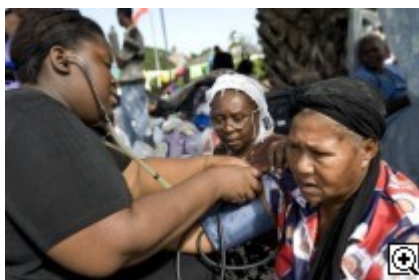
Earthquake victims receive medical treatment at an encampment in front of Port-au-Prince's Presidential Palace, 14 January 2010.