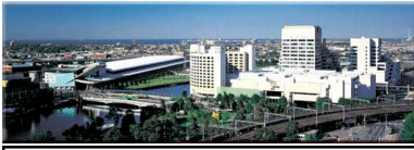
Melbourne Conference Center