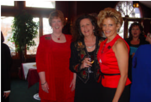
New Club Members...

A great time was had by all—wonderful food, marvelous company and great new Zontians!